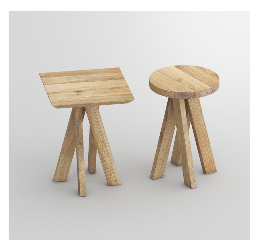
Table ZIRKEL doesn't beat around the bush, presenting its beautiful presence. Sociable gathering with casual footwork running in circles around the tabletop. Always on the move conquering the catwalks with its excellent solid wood style. Combining great design in different shapes with natural sustainability. A true model: round or angular, ZIRKEL presents itself in almost every desired size.

Available in all solid wood types from vitamin design collection: European oak and knotted oak, ash, beech, core beech, American maple, walnut and cherry wood, treated with herbal oil.