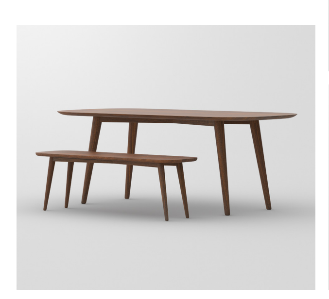
Table made of solid American walnut, 180 x 90 cm 2707 Euro Sideboard made of solid American walnut, 200 x 46 x 80 cm 4871 Euro